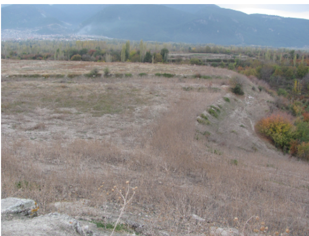
Fig 2. View of modern Colossae