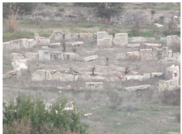
Fig 3. Remains of a Necropolis at Colossae